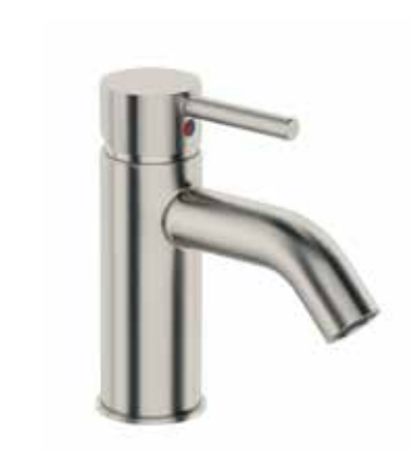
UNO BASIN MIXER