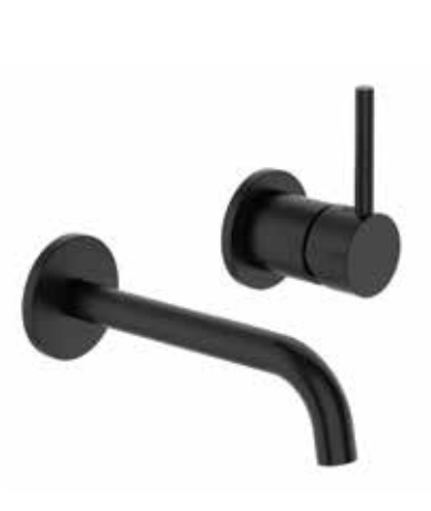
UNO WALL BASIN MIXER