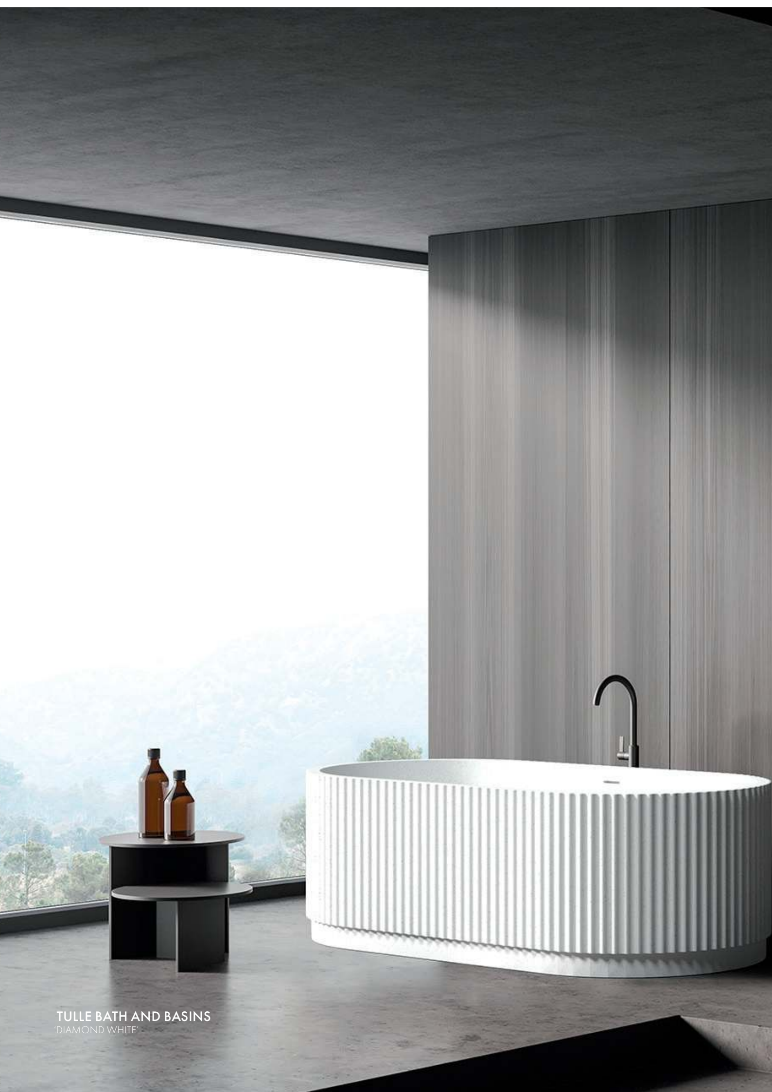
TULLE BATH AND BASINS 'DIAMOND WHITE'