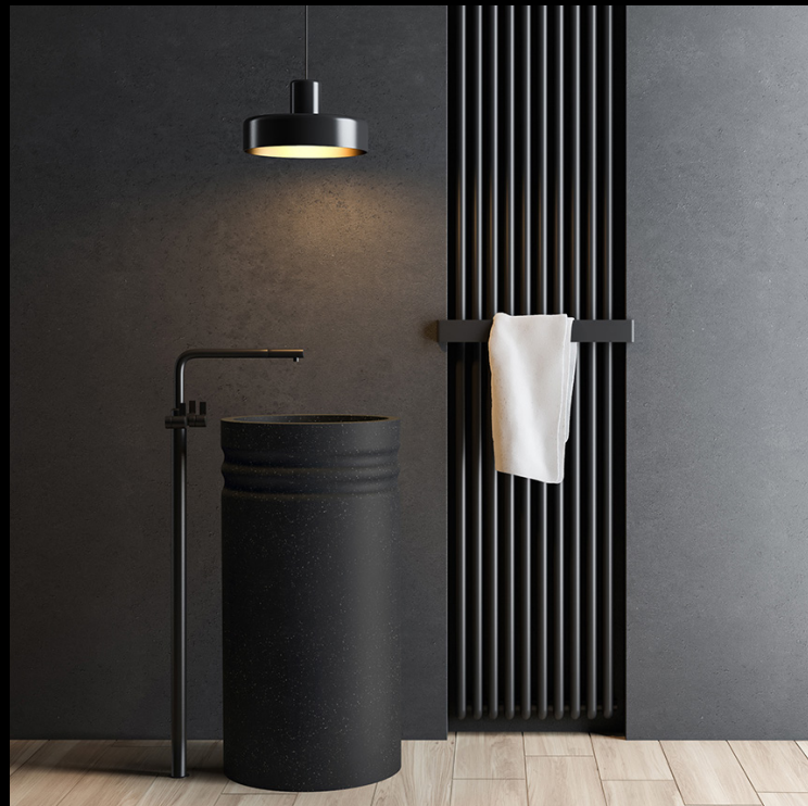
Ode Freestanding Basin Finish: Graphite

All Apaiser products are handcrafted from ApaiserMARBLE® – a luxurious blend of repurposed marble, combined with stone and minerals sourced from the rich soils of the Australian Barossa region.