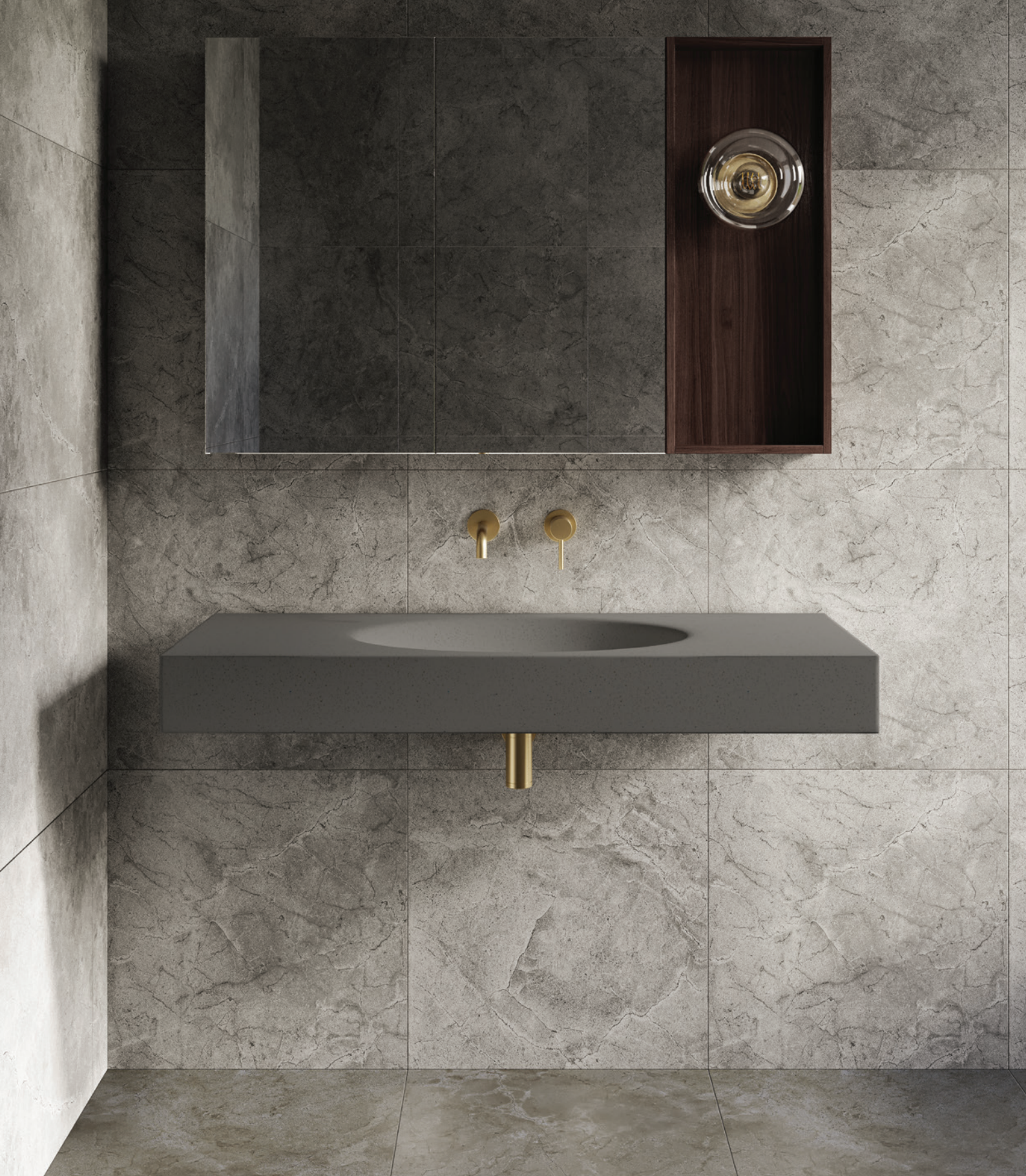
Haven Wall Basin Finish: Charcoal