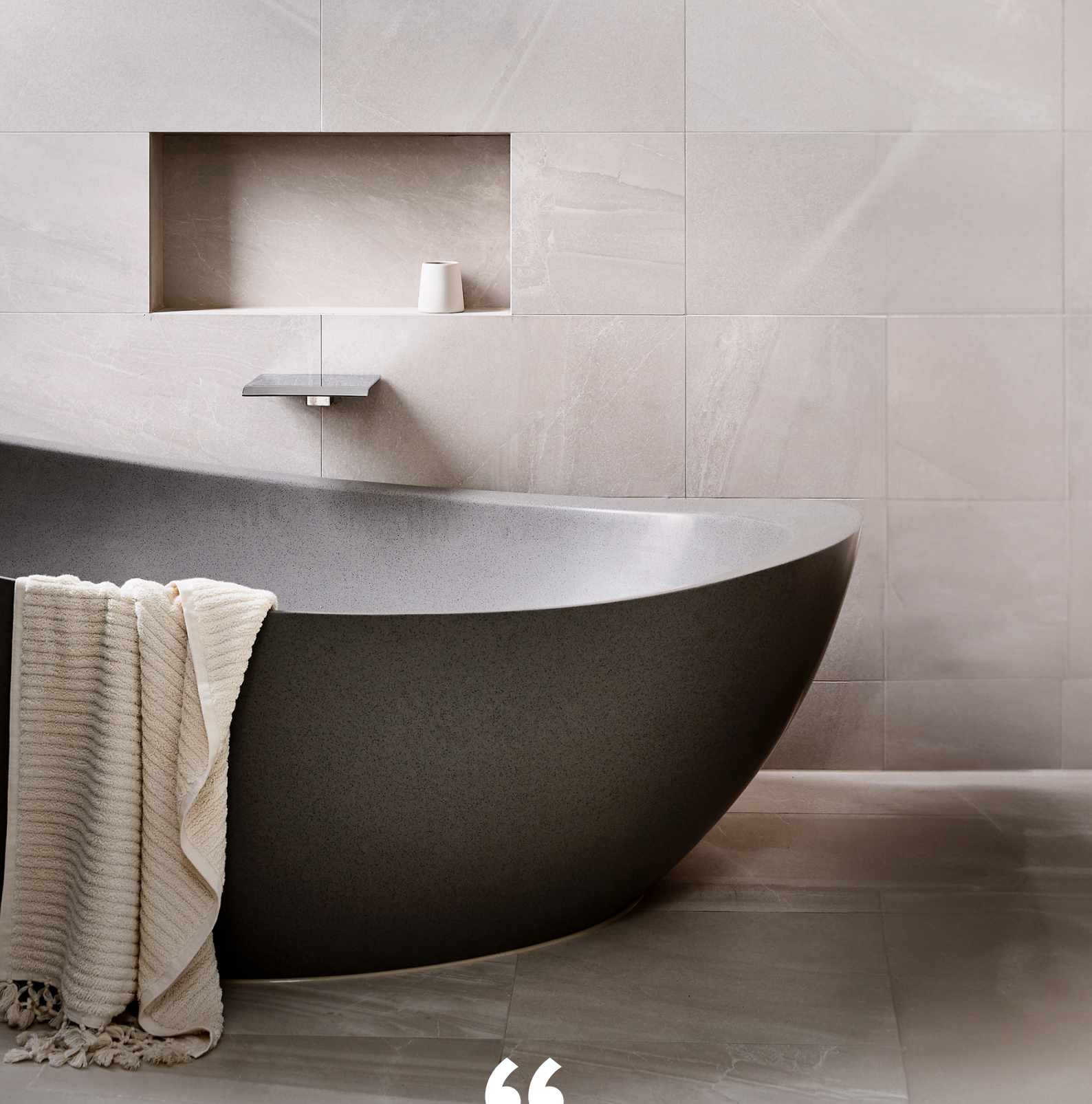
Oman Freestanding Bath Finish: Nimbus