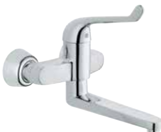
32 793 000 Euroeco Special Single-lever safety basin mixer, ½" wall-mounted adjustable flow rate limiter cast swivel spout, lockable laminar flow straightener 9 ltrs/min projection 256mm metal lever 170mm temperature limiter WELS 0 star, 9.5 ltrs/min