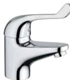
32 789 000 Euroeco Special Single-lever safety basin mixer ½ Single hole installation Adjustable flow rate limiter Laminar flow straightener 9 ltrs/min Metal lever 120mm Temperature limiter WELS 0 star, 9 ltrs/min