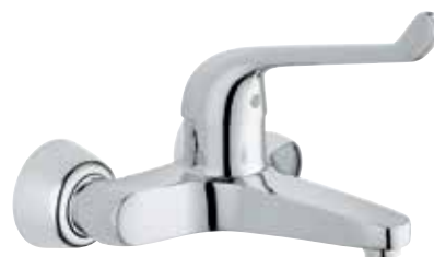
32 795 000 Euroeco Special Single-lever safety basin mixer, ½" wall-mounted adjustable flow rate limiter cast spout laminar flow straightener 9 ltrs/min projection 204mm metal lever 170mm temperature limiter WELS 0 star, 9.5 ltrs/min